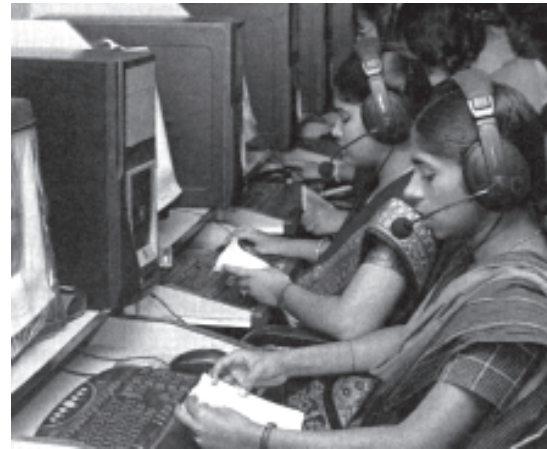
A Call Centre

Nike grew enormously from its inception in the 1960s. Nike grew as an importer of shoes. The founder Phil Knight imported shoes from Japan and sold them at athletics meetings. The company grew to a multinational enterprise, a transnational corporation. Its headquarters are in Beverton, just outside Portland, Oregon. Only two US factories ever made shoes for Nike. In the 1960s they were made in Japan. As costs increased production shifted to South Korea in mid-1970s. Labour costs grew in South Korea, so in the 1980s production widened to Thailand and Indonesia. In the 1990s we in India produce Nike. However, if labour is cheaper elsewhere production centres will move somewhere else. This entire process makes the labouring population very vulnerable and insecure. This flexibility of labour often works in favour of the producers. Instead of mass production of goods at a centralised location (Fordism), we have moved to a system of flexible production at dispersed locations (post-Fordism).