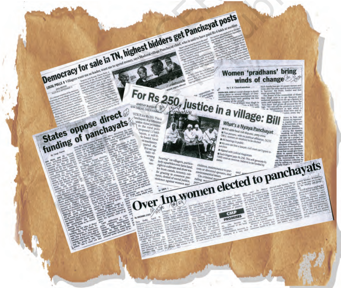
What do these newspaper clippings have to say about efforts of decentralisation in India?

Prime Minister runs the country. Chief Minister runs the state. Logically, then, the chairperson of Zilla Parishad should run the district. Why does the D.M. or Collector administer the district?