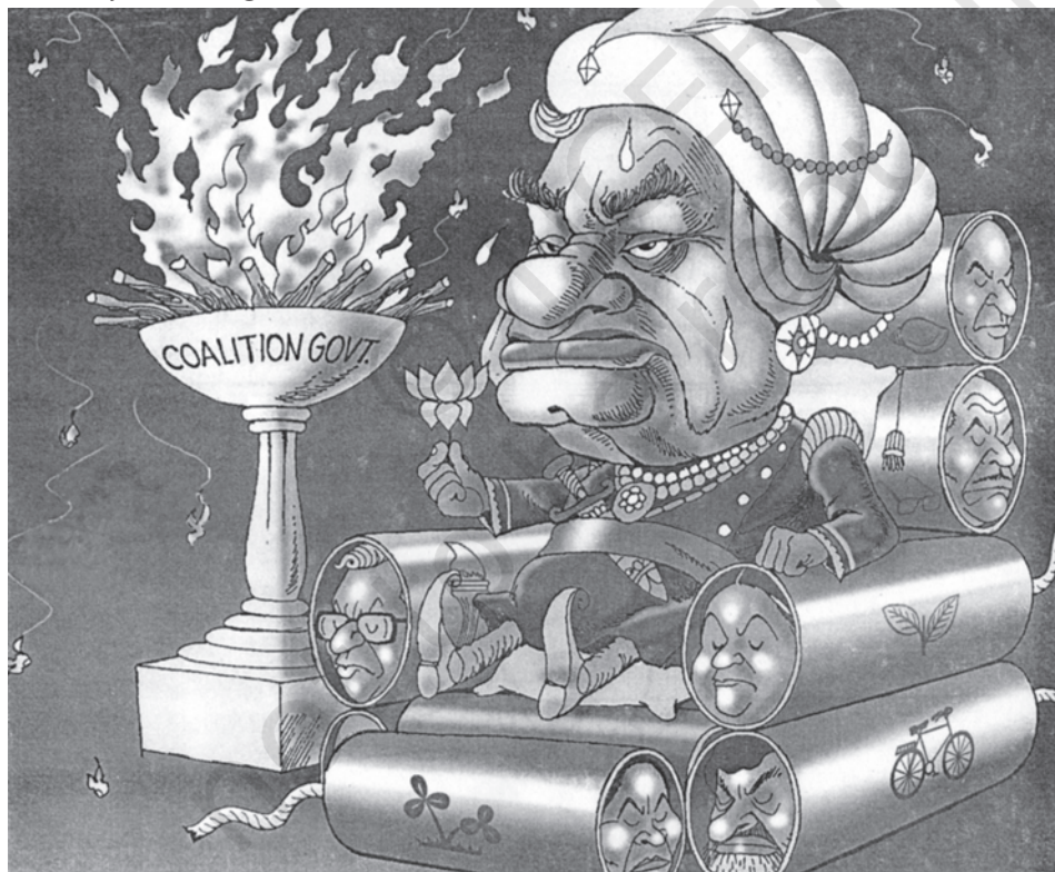
© Ajith Ninan - India Today Book of Cartoons

Here are two cartoons showing the relationship between Centre and States. Should the State go to the Centre with a begging bowl? How can the leader of a coalition keep the partners of government satisfied?