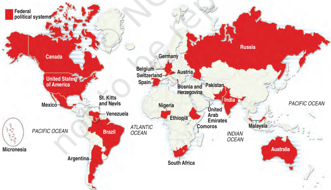
Source: Montreal and Kingston, Handbook of Federal Countries: 2002 , McGill-Queen's University Press, 2002.

Federalism is a system of government in which the power is divided between a central authority and various constituent units of the country. Usually, a federation has two levels of government. One is the government for the entire country that is usually responsible for a few subjects of common national interest. The others are governments at the level of provinces or states that look after much of the day-to-day administering of their state. Both these levels of governments enjoy their power independent of the other.