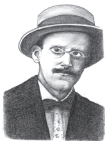
James Joyce 1882-1941

James Joyce is a major literary figure of the first quarter of the twentieth century. He is known for his bold experiments in narrative techniques in fiction, and Ulysses is his most famous work. 'Eveline' is one of the fifteen stories of Dublin life that form Dubliners, first published in 1914. It is a sympathetic portrayal of Eveline, who has within her reach escape from the drudgery of her life but cannot gather enough courage to seize it.